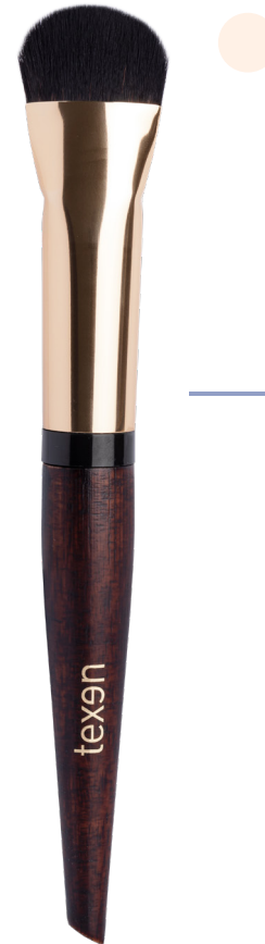
STEP 2 - Apply: Perfect length and density