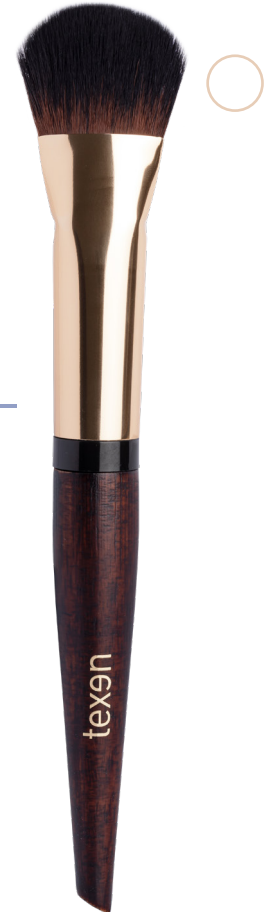
STEP 3 - Blend: Puffy and flowy brush