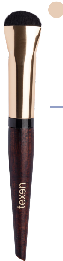
STEP 1 - Define: Short and thick brush