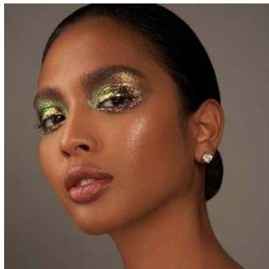
Infinite chomes flakes look by Danessa Myricks

Half of consumers nowadays look for products to create daring makeup looks. Embracing their true self to stand out and break the beauty standards whilst still having fun. Like metallic makeup, a result that stays bold and unique enough to satisfy consumers' desire to experiment with makeup trends.